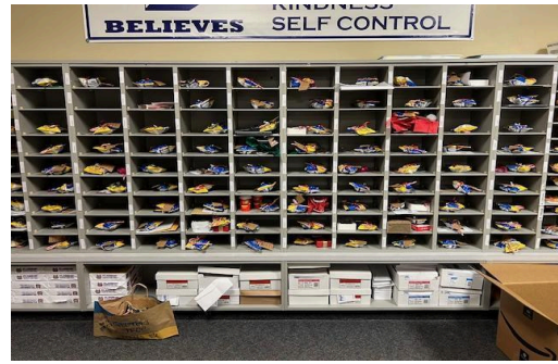
(TCMS hospitality treats for staff)